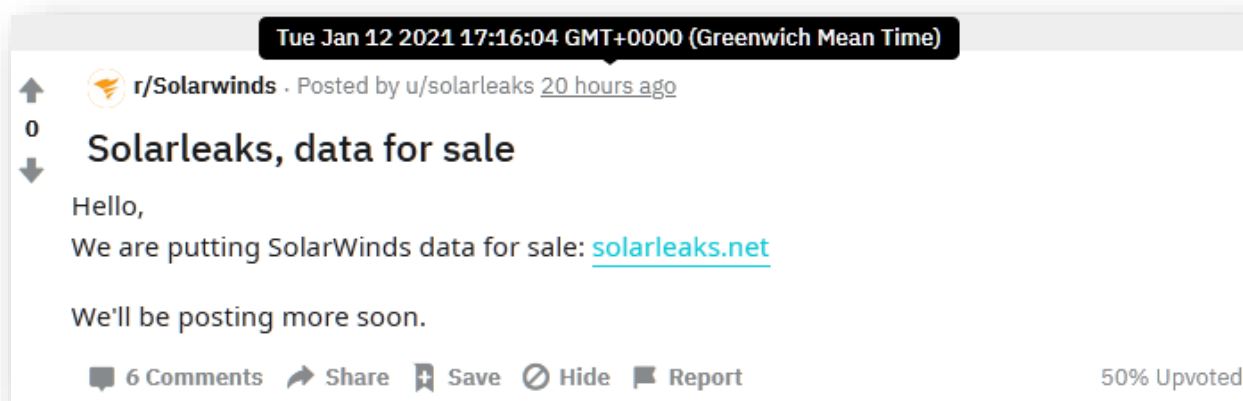
Figure 1 - SolarWinds leak announcement on Reddit

Seemingly first announced on Reddit at 1716hrs GMT on 12 January 2021 within the SolarWinds subreddit, r/Solarwinds , a user named u/solarleaks posted a message, since removed, claiming to have SolarWinds' data for sale along with a link to the solarleaks[.]net website (Figure 1).